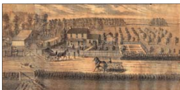
Midwestern period farm typical of some in Kansas.